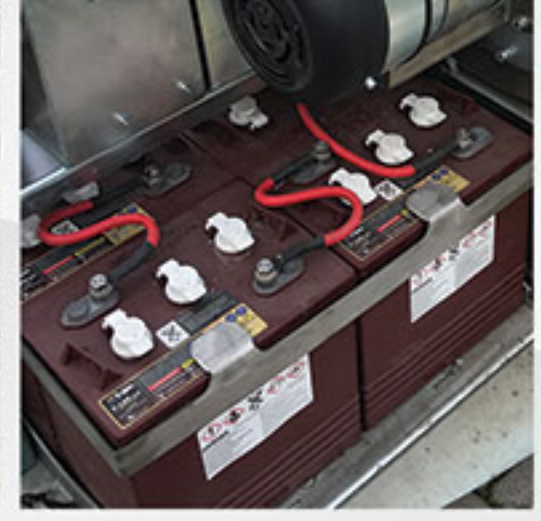
Long working life dry batteries; optionally gel or lithium type.