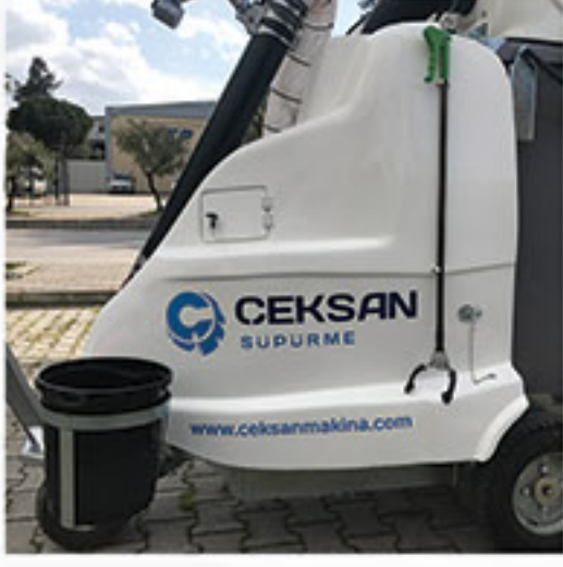
Side bin and manual grip for bulky materials