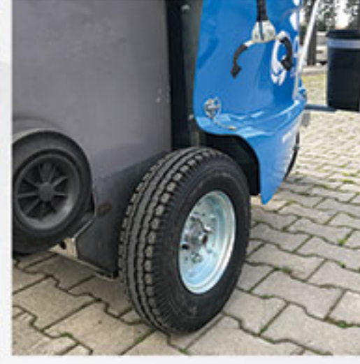
Industrial type tyres