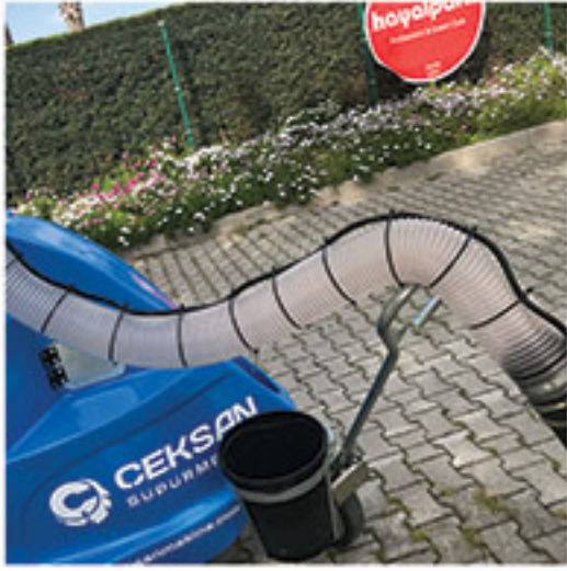
Flexible and transparent suction hose