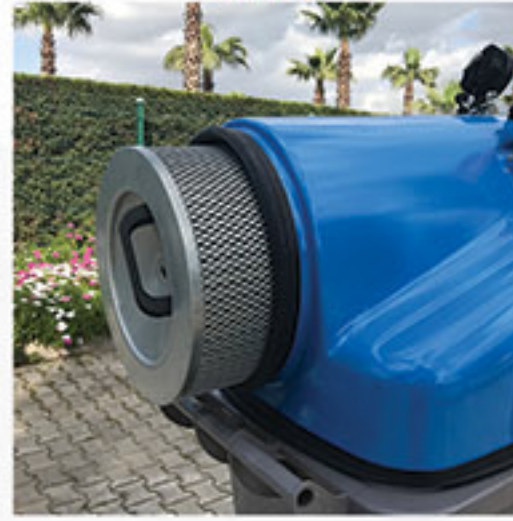
Washable mesh filter, optionally paper filter available