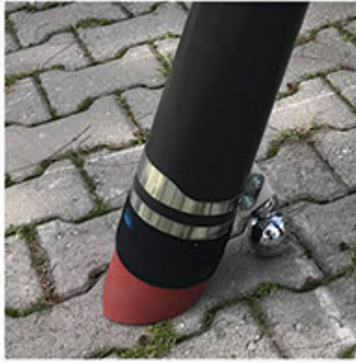
Wheel kit support