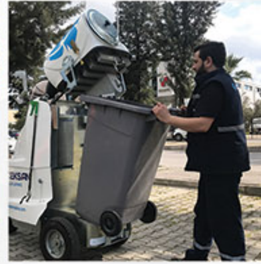
240 lt standard bin